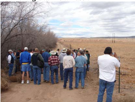
↑Salt Cedar thicket