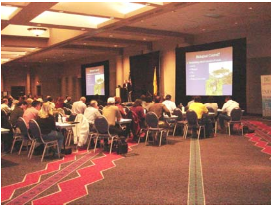
Convention Center Ballroom Presentation